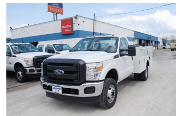
2011 FORD F-350 4X4 GAS/AUTO, 13.3K GVWR W/9' UTILITY BODY