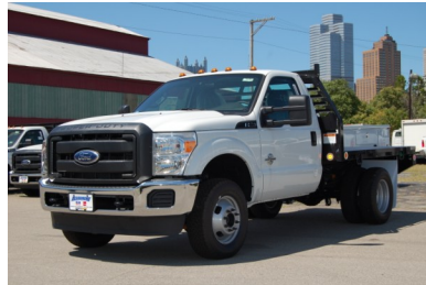
2011 FORD F-350 4X4 DIESEL/AUTO 13.3K GVWR W/9' HAULER BODY