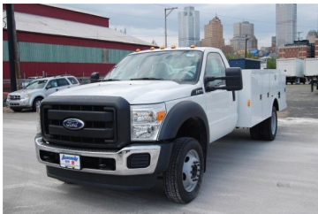
2011 FORD F-550 4X4 GAS/AUTO, 19.5K GVWR W/11' UTILITY BODY