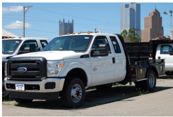
2011 FORD F-350 SUPERCAB 4X4 DIESEL/AUTO, 13.3.K GVWR W/9' SKIRTED HAULER