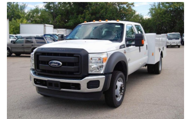
2011 FORD F-450 CREW CAB DIESEL/AUTO 16.5K GVWR W/9' UTILITY BODY